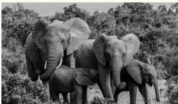
Protection of natural habitats