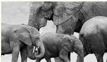
Community conservation programs